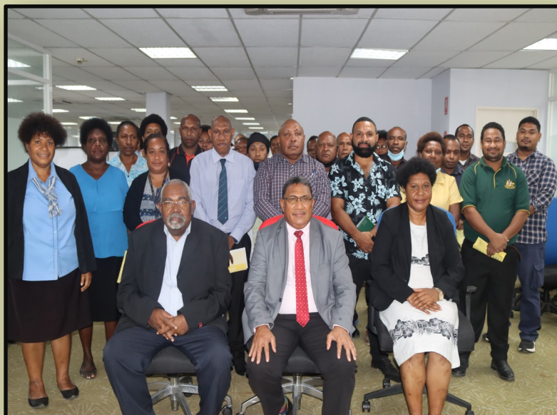
PSC Chairman (c ) flanked by the two newly appointed Commissioners, and staff of the PSC Secretariat welcoming the Commissioners into Office.

Meantime, PSC Chairman added that he has complete trust in the appointments of the Commission Members and he looks forward to working along side them to make this year a successful one through the roles and